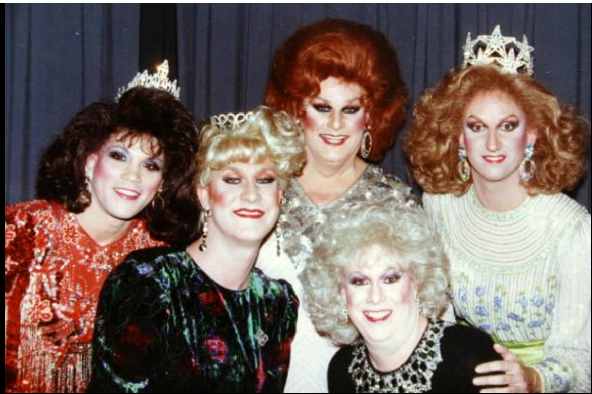
Lucille and her drag daughters Alexis Colby, Susan Anton, Suzanne Sugarbaker and Dyan Cannon.