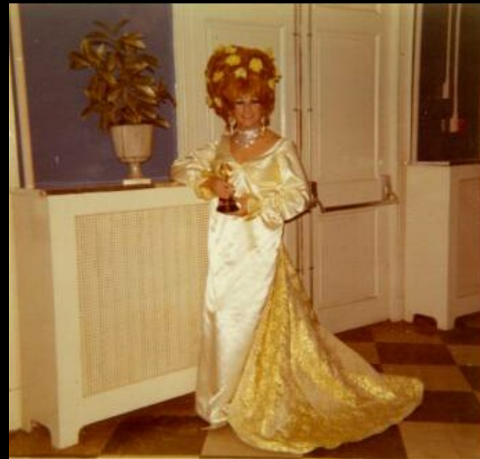
Lucille At the 1971 Emmys