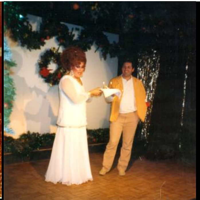
Lucille Ball and Rock Hudson at the 1986 Holiday Show