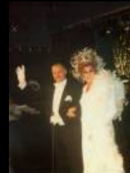
Empress of the Silver Screen