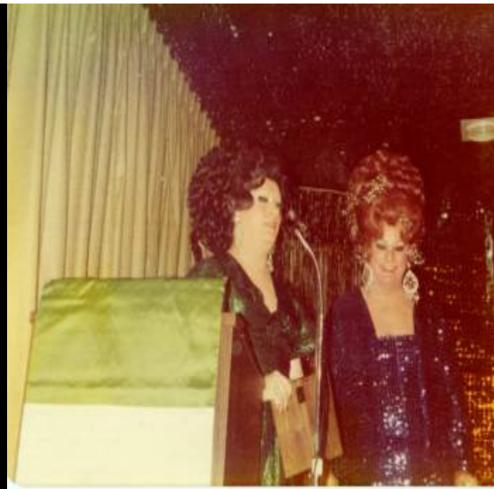
Mame Dennis and Lucille Ball at the 1973 St. Patrick's Day Party