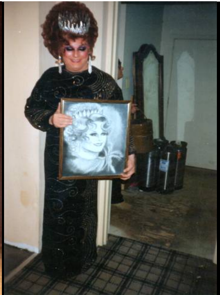
Holding her portrait done by Eve Harrington