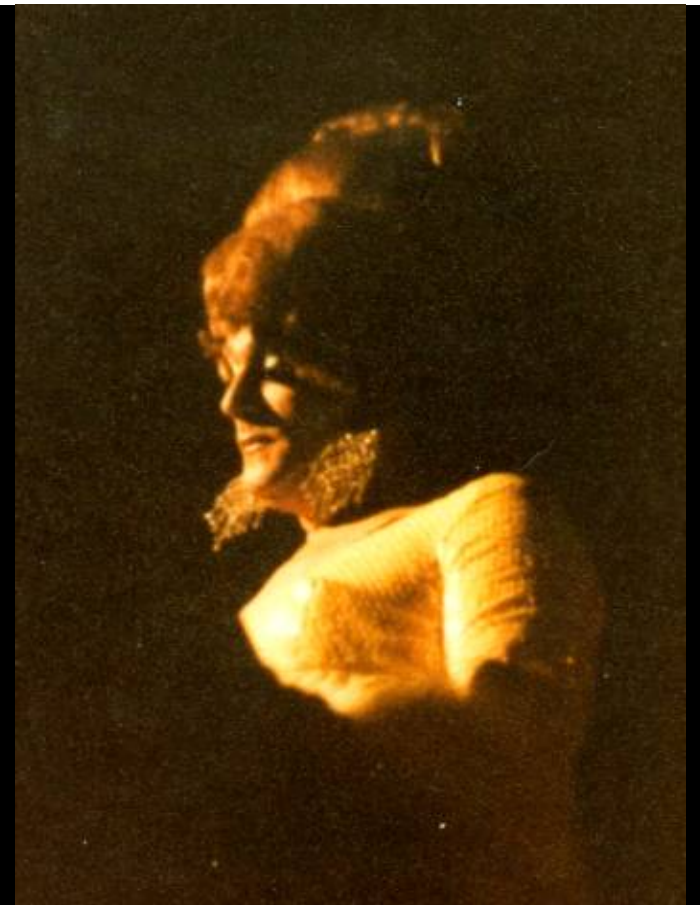
Lucille Ball: "The Epitome of Drag in Washington"