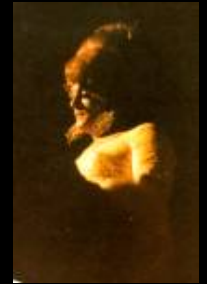
Miscellaneous (updated 09-21-2008)

Interested in printing or downloading a copy of all of the Lucille Ball Memorial pages? Click here to download these pages in Adobe Acrobat pdf format which you can then save to your computer or print. If you don't have the free Adobe pdf reader, click here .