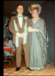
Miss Academy Awards